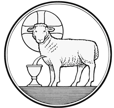
A LAMB GOES UNCOMPLAINING FORTH

LENT CONTINUES THIS WEEK This year's series is titled: " A Lamb Goes Uncomplaining Forth ", and are based on a sermon series from a Professor of our seminary in 1889. Services are on Wednesday evenings at 7pm. Lenten suppers will begin each week at 6:00pm (except for Ash Wednesday when there is no supper.) A schedule for this Lenten season is included as an insert in this bulletin. Please start making plans now in your schedule to be able to spend some time with the Lord during this blessed season of the church year.